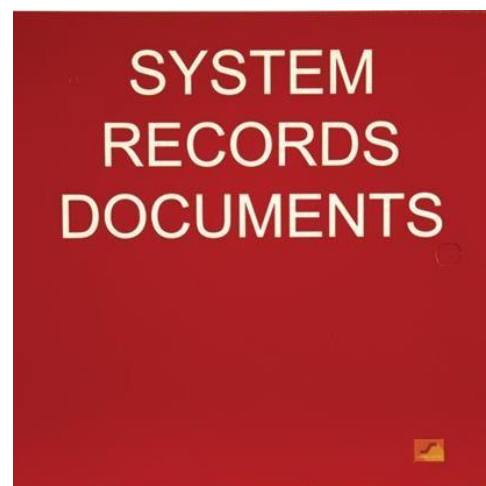
Approved Document Box