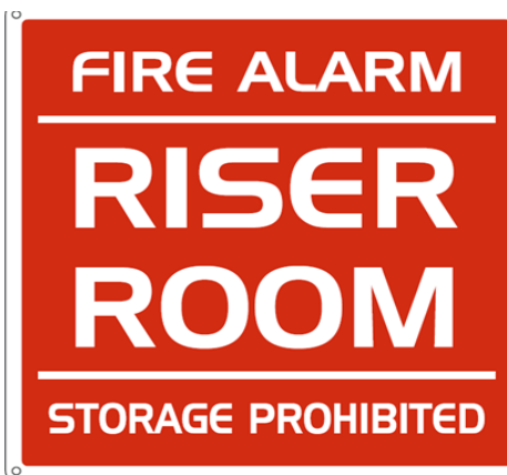
Riser Room Sign