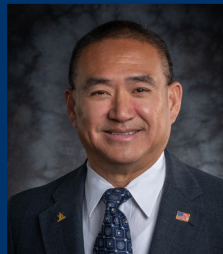
Long Pham District 6