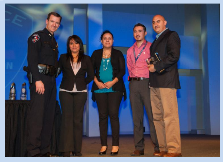
Crossway Apartment Community – Winner of the 2012 APD Business Partnership Award