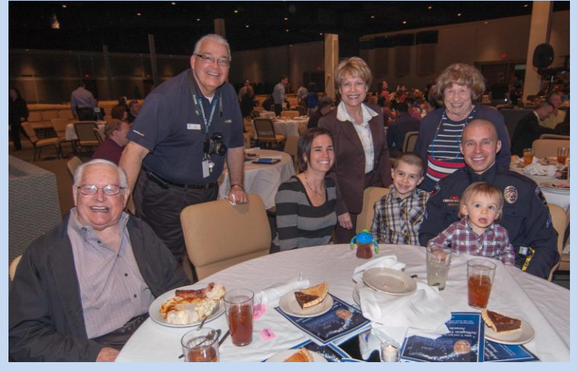
Celebrating with family - West District Officer of the Year