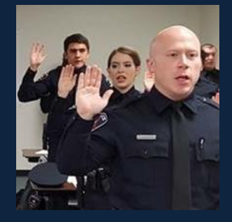
"I do solemnly swear ..."

"It is our spoken commitment to uphold the Constitution of the United States and the commitments we have made to our department's mission and values."